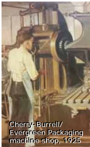
Cherry-Burrell/ Evergreen Packaging machine shop, 1925