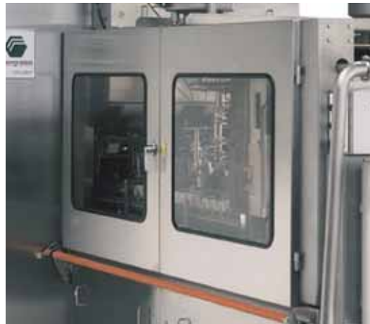
Old N8 enclosure doors