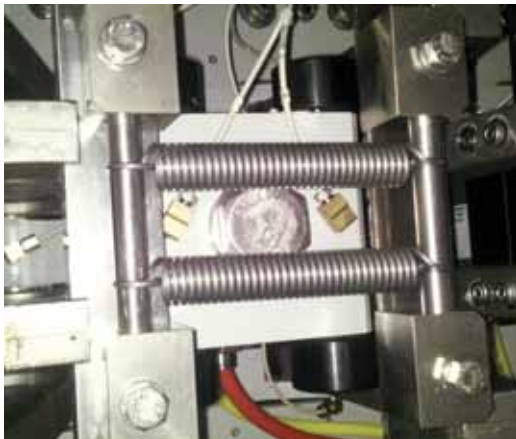
Old N8 top squeezer springs

One 3058669 kit provides parts to update all four lines.