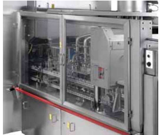
New N8 enclosure doors

Do you have a question or topic that you would like to see featured in a future Run Time ? Send your suggestions to sheri.albrecht@everpack.com or call 319-399-3481.