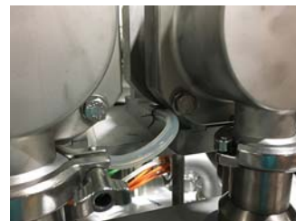
Tube from metering bowls to reservoir

collects, a signal is displayed on the HMI operator display to indicate a buildup of moisture in the reservoir. To remove any build-up of moisture, the hand valve at the bottom of the reservoir should be opened periodically.