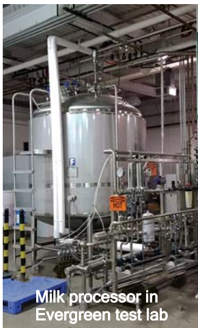
Milk processor in Evergreen test lab