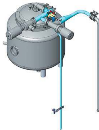
Parts included in kit 3058845 are shown in color.

SS Burst Disc Update Kit 3058845 includes all parts and instructions necessary to install the stainless steel burst disc. For more information, call the TST at 319-399-3300. To order, contact Sales Services at evergreenparts@everpack.com or 800-553-5981.